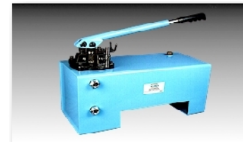
HIGH PRESSURE PUMP MODEL : HP5012-700-13

DESIGNED TO PERFORM UNDER TOUGHEST CONDITION